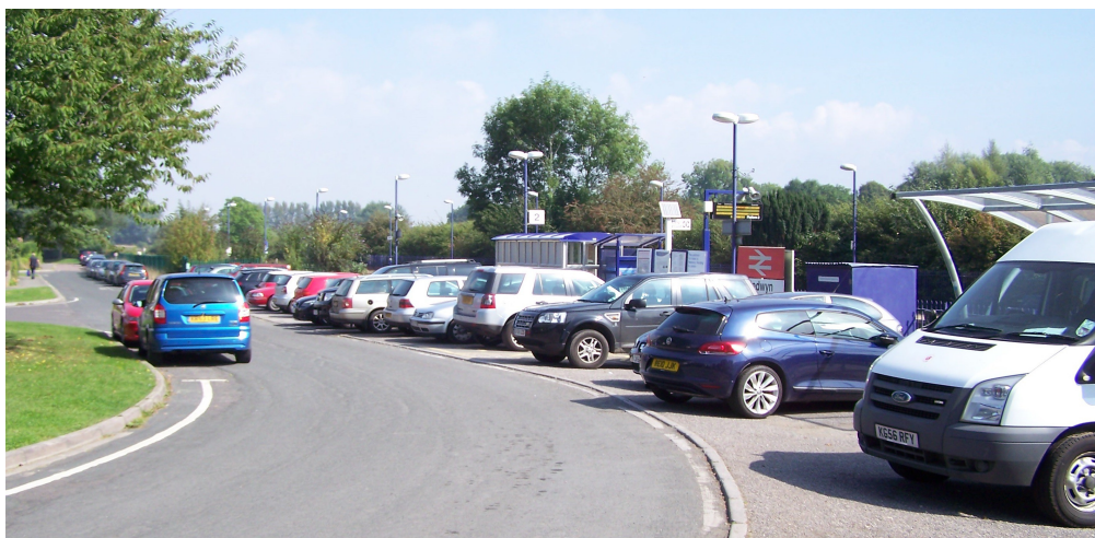
Parking spaces are always at a premium at Bedwyn station

The most recent passenger figures suggest that more than 60% of passenger journeys that are currently made out of Bedwyn station (estimated to be 138,917 per year) originate outside the village of Great Bedwyn (which has a population of just 1,347). The number of passenger journeys to Reading and London Paddington is expected to rise once line electrification is extended as far as Bedwyn.